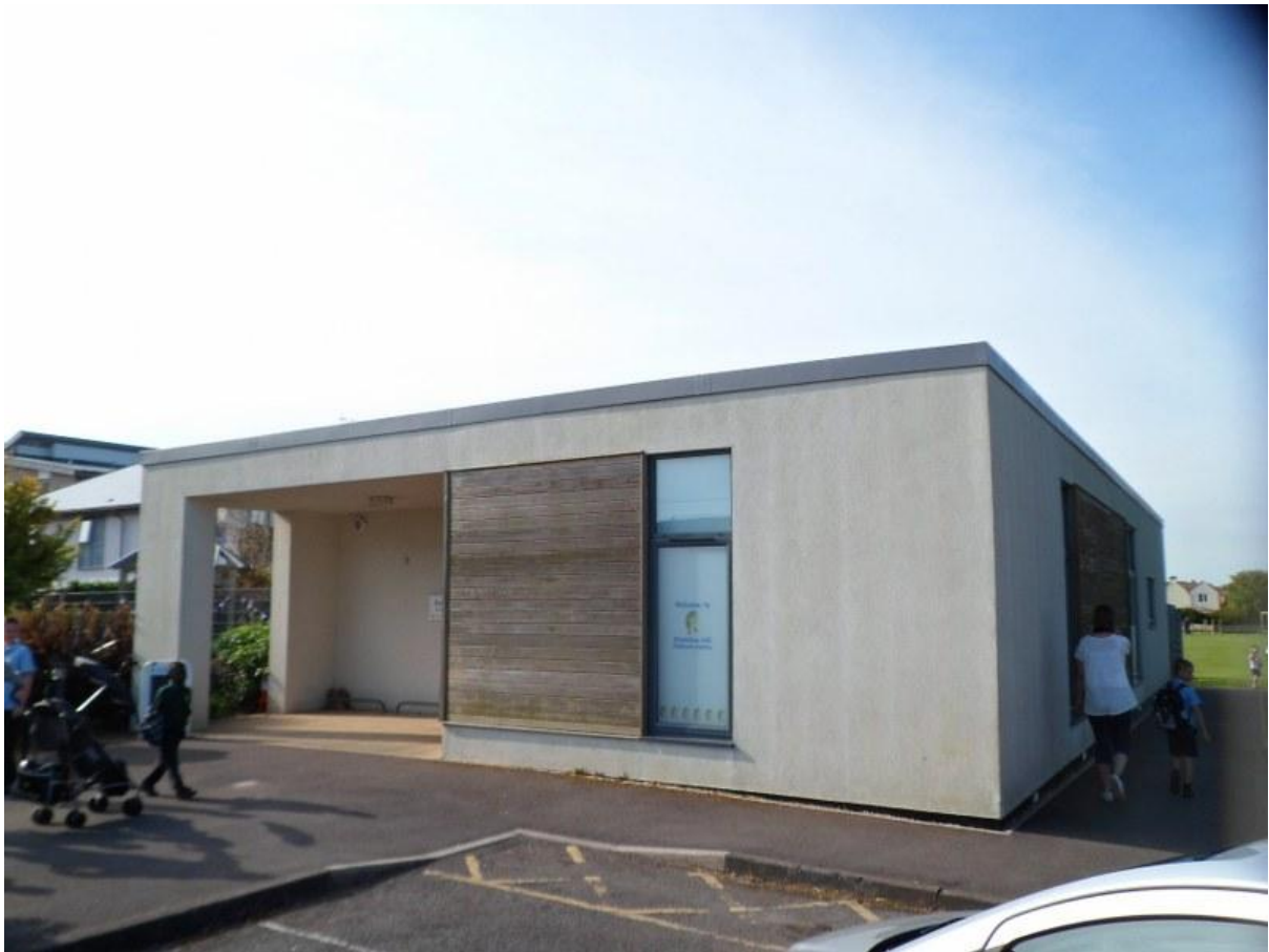
Stubblee Children's Centre