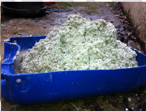
Internal condition post work