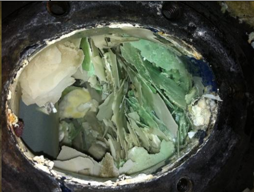
Internal condition pre work