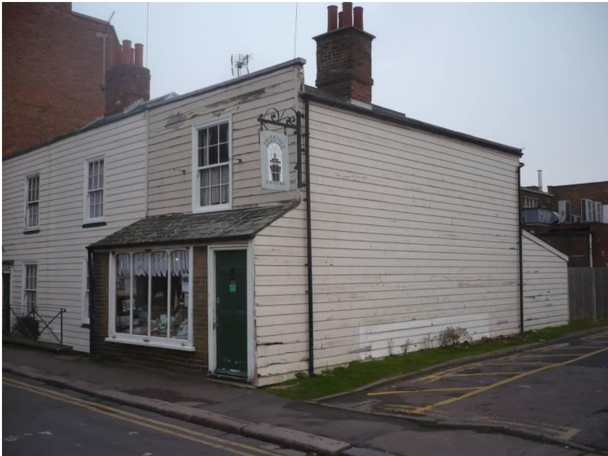
Rose Street Heritage Centre