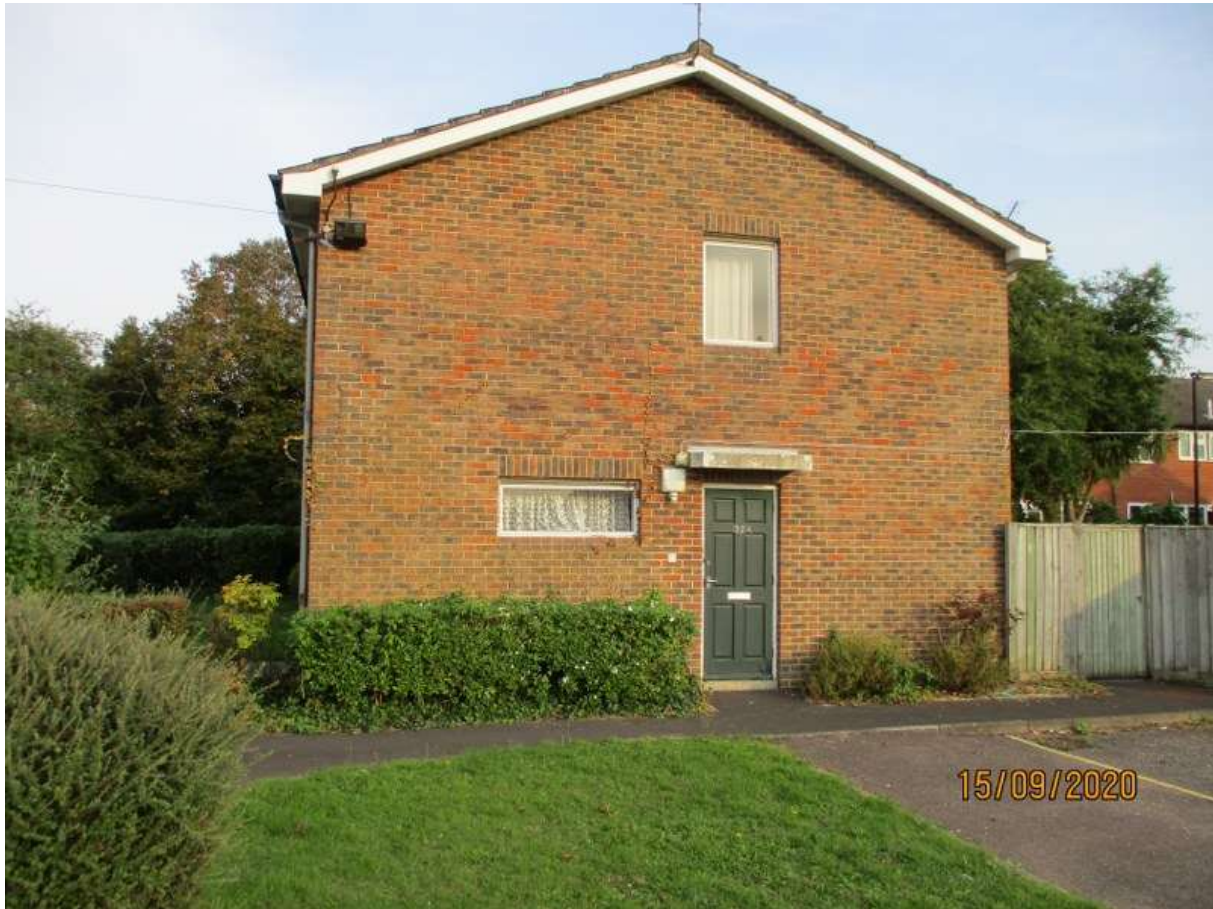
32A Kentish Road