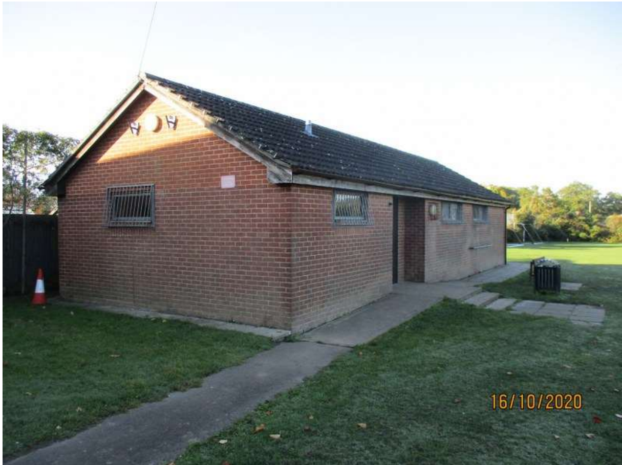
Bitterne Sports Pavilion