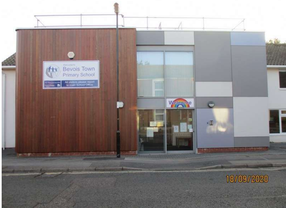
Rainbow Block (Bevois Town Primary School)